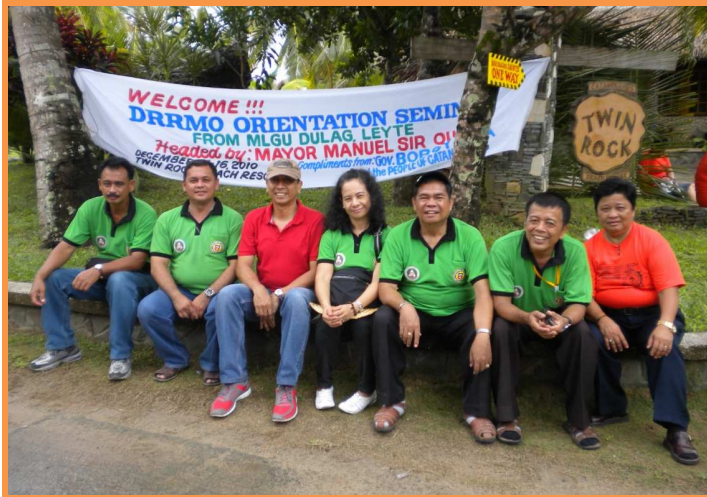
The workshop training staff (left) on a brief respite from the workshop poses in front of the Twin Peak resort area.