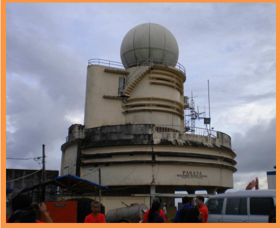
A brief tour of several facilities within Virac included a visit to the Solong Hydroelectric Power plant (top left) and the PAGASA (Weather Bureau) Radar station (top right) accompanied by Catanduanes provincial Government personnel and using the Province's Official Bus.