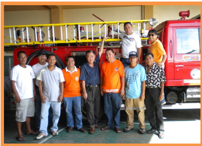
Pictured below, the group travelled from Virac to Tobacco via a ferry boat. The trip was definitely a worthwhile experience to the whole group. While in Tabaco, Albay, the group made a quick visit and fostered good relationship with the Tabaco Chinese Filipino Volunteer Fire Brigade (left).