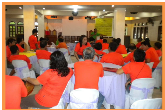
Workshop participants inside the training hall showing its relatively spacious area (above).

Topics that were discussed during the 2-day event included Hydrometeorological-related hazards awareness and mitigation, Climate Change, Presentation of R.A. 10121 and issues relating to calamity fund utilization. On the other hand, the workshop dealt in particular with plotting and tracking of tropical cyclones, setting-up of the town's organizational structure with regards to R.A. 10121, its work and financial plan, and programs and activities.