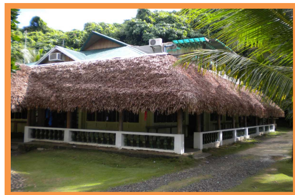
The training hall used during the workshop (top picture) situated just adjacent to the beach.

Venue: Twin Rock, located at Igang, Virac in the province of Catanduanes is around 15 minutes drive from Virac domestic airport and around 30 minutes drive from the town's seaport. The resort can be viewed while on board the ferry boat.